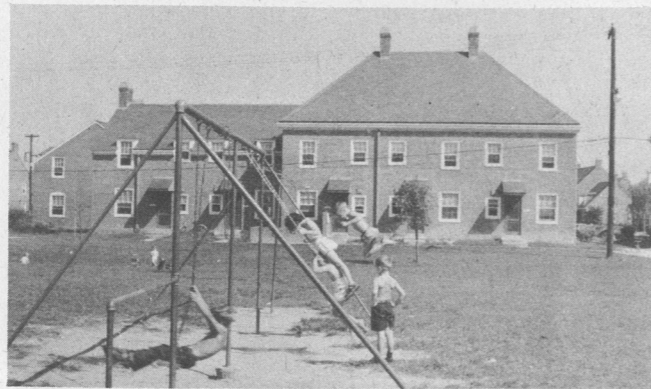
Income from Paper Drives - - - - Buys Recreation Equipment