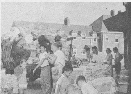
PAPER DRIVE SCENES